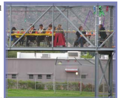
Dinner Over Diamond Youth Team event brings support from all ages.

United Way thanks all the Youth Team members and their families and friends who supported their efforts in reaching the fundraising goal!