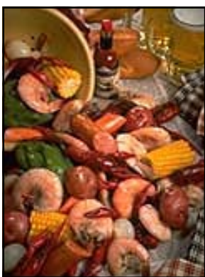
Seafood Boil included lobster, shrimp, mussels, corn-on-the-cob and potatoes.

The Community Solutions Fund makes it possible to grant funding to 13 local organizations.